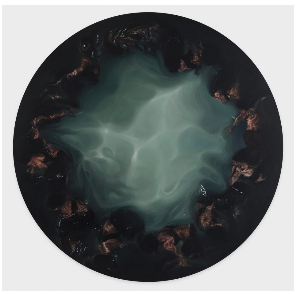
Calida Rawles, "Like Other Gods With Ancient Rage" (2023), acrylic on canvas, 84 x 84 x 3 inches in diameter