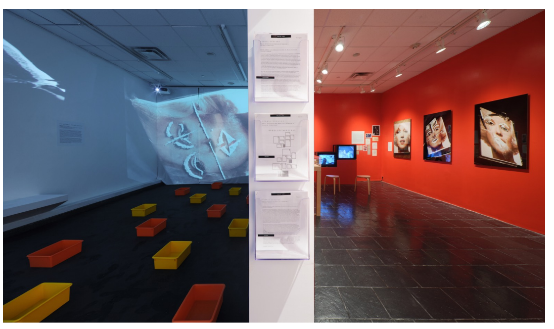
Installation view of Cosmic Shelter: Hélio Oiticica and Neville D'Almeida's Private Cosmococas at Leubsdorf Gallery, Hunter College