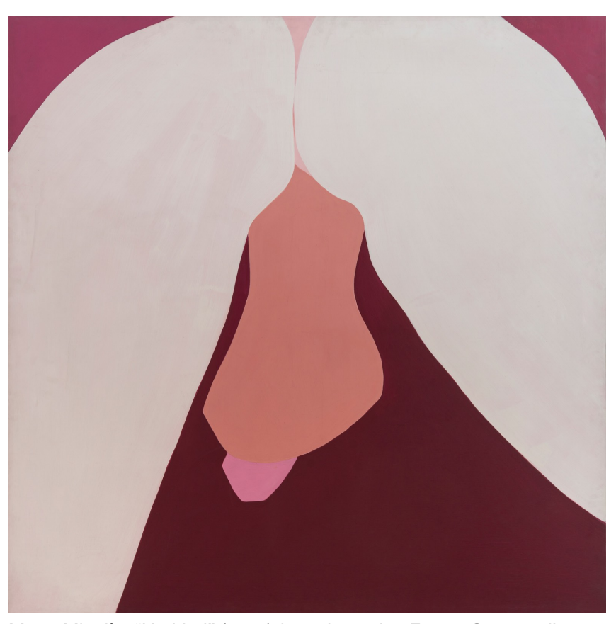
Marta Minujín, "Untitled" (1973) from the series Frozen Sex , acrylic on canvas, 50 3/4 x 50 3/4 inches