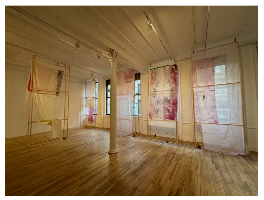
A view of the threshhold_impression series at Duane Linklater's dressing exhibition at Bortolami gallery