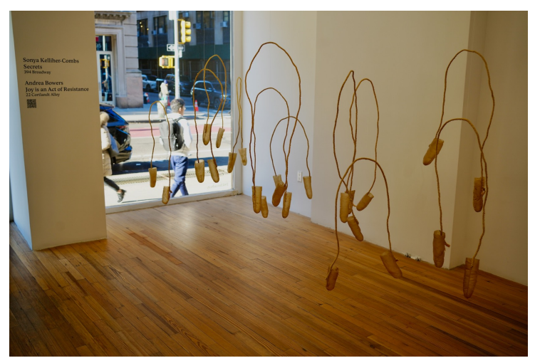
A view of Sonya Kelliher-Combs's "Natural Idiot Strings" (2023)