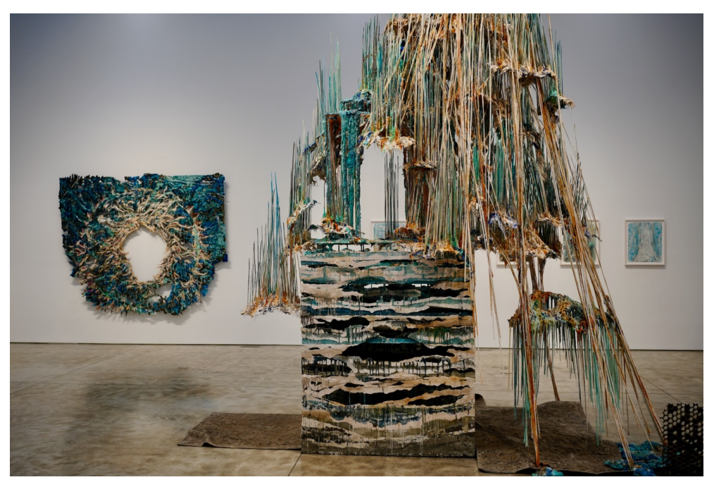
A view of Diana Al-Hadid's Women, Bronze, and Dangerous Things exhibition at Kasmin Gallery, including "Blue Medusa" (2023) on the left