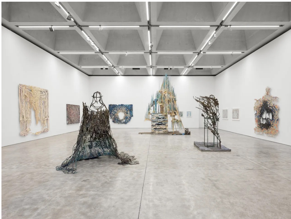
The Bride in the Large Glass is pictured at front left. Mother Splits the Moon in back middle.